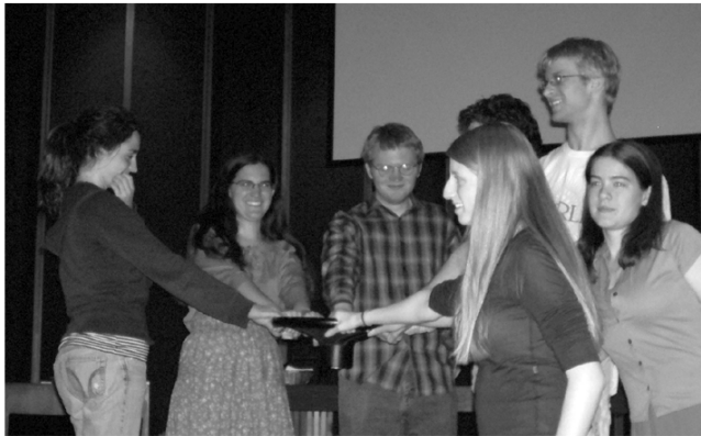
THE 2007-2008 STEERING COMMITTEE

“I really like the opportunity PCC presents to learn new hymns from other denominations and sources besides my home church’s hymnal. This does not always go as planned, though! Some of my favorite PCC funny moments are the times when so few people in the congregation were familiar with a song that singing it became a complete trainwreck and we all ended up laughing.”