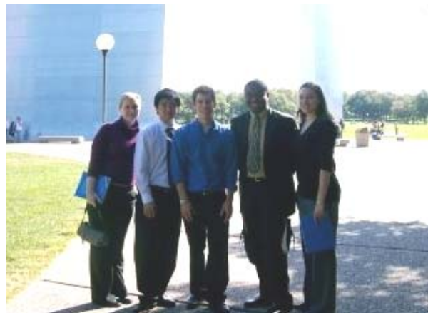
Group of BME Students at the BMES National Conference

In addition, graduate school representatives filled the rooms with chatter about M.S. and PhD programs. They collected information from prospective